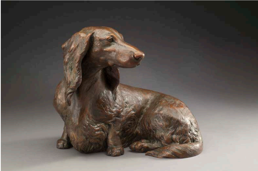
"So Good to See You" ML 14½" L x 12" D x 12" H, Bronze, Edition: 10 & 1 Artist's Proof, ©2011. All Rights Reserved.

See "So Good to See You" ML, at the American Women Artists show.